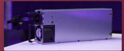
G1483-0600WNB, hot-swap 600 W power supply, available for purchase separately!

4K security cameras with built-in winter heating elements, LED ad screens, PoE-powered light fixtures – CRS320 can output up to 90W per port , enough even for the most demanding devices! It comes with a reliable 600 W power supply, but we've reserved an expansion slot for an additional PSU, in case you need to raise the power output to 1150 W.