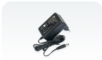
24 V 0.8 A power adapter