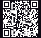
RUT241 360° VIEW