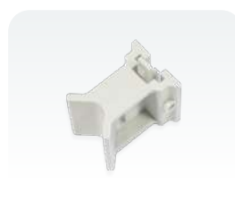
Pole mounting bracket