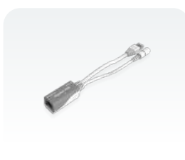
Gigabit PoE injector