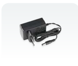
24 V 1.2 A power adapter